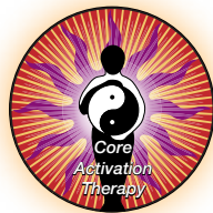
YANG side Active