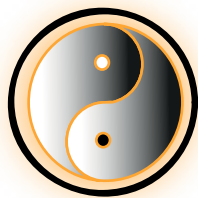
2 sides Balance