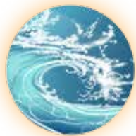
YIN side Passive