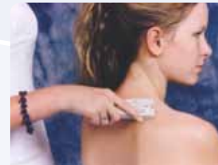
THERAPIST USE and

The ENAR therapy device is a hand-held, battery operated, therapeutic medical device, for personal use. The ENAR or Electro-Neuro-Adaptive-Regulator, delivers natural, non-invasive, non-toxic, computer-modulated, interactive nerve innervation electro-stimulation, onto and through the skin.