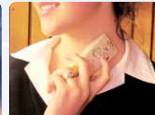
PERSONAL HOME USE